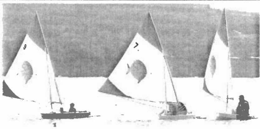
Top photo shows racers approaching the leeward mark. Boat 9 must stand clear of 7 and 4 due to overlaps. Bottom photo shows boats after rounding the mark. Boat 9 can demand room from 7 but 7 cannot give room until 4 moves clear. If 4 does not move clear, 7 can protest 4 and 9 can protest 7. No collisions please!

Important notice. The YMCA owns the Sunfish sailboats numbers 1 through 9 and these boats should be treated with the utmost care. YMCA membership (935-3721). Attention! Boats 1 through 9 can only be used on club/Y sponsored official sail days or for Y sponsored training.